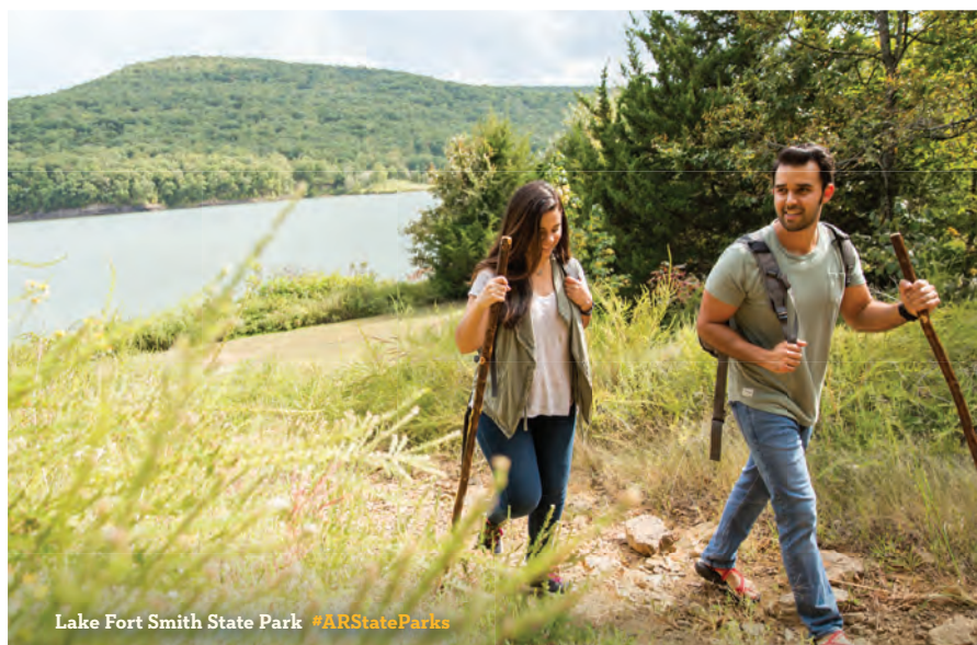
Lake Fort Smith State Park #ARStateParks

When you're ready to relax, end the day in the luxury of the Lodge at Mount